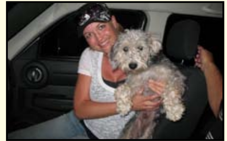
“Felix” and his new guardian.