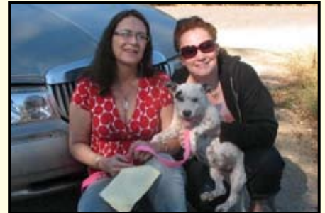
“Petey”, the cow dog is adopted!