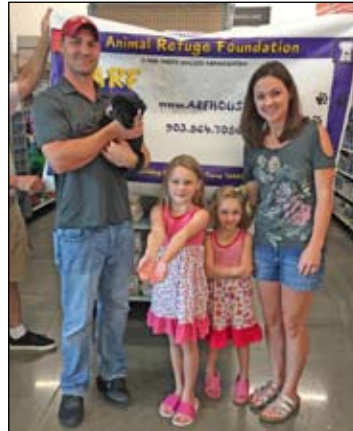
The Kastl family with our sweet "Clyde"