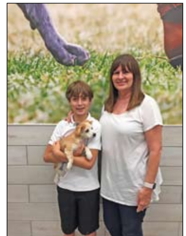
The Crow family with happy little "Sundance."