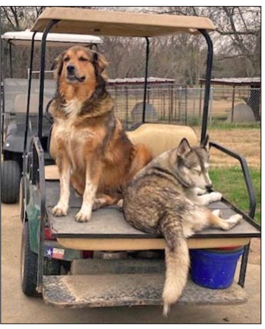
The girls getting ready to work.