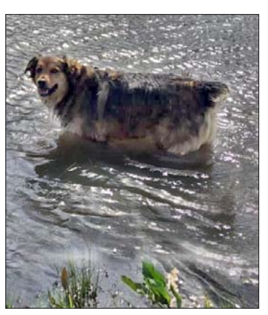
Jazz cooling off in the pond.

Pupdate: in the last issue of our newsletter, I misspoke when I said we had transported over 200 puppies to our partner rescue in Colorado. So far this year, we have transported 107 to LifeLine Puppy Rescue. 107 puppies off the streets, spayed, neutered, and living the life in Brighton!